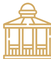
Covered Seating Area