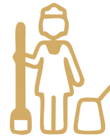
Driver / Servant Room