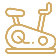
Double Height Gym