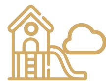
Toddler's Play Zone