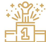
Podium Level Amenities