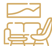
Grand Entrance Lobby