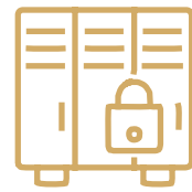
Security Cabin With Locker Room