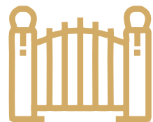
Grand Entrance Gate