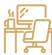
Co-Working Office Space